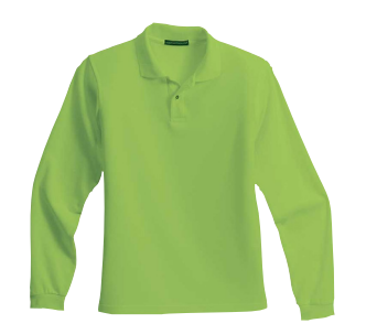
**Not all colors are available in all sizes**