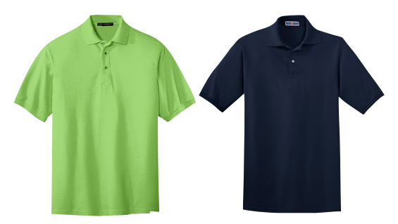
**Not all colors are available in all sizes**