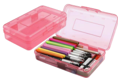
1 pencil box or pencil pouch