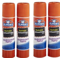
4 glue sticks