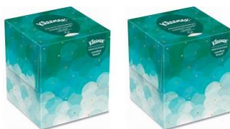
2 or more boxes of tissue