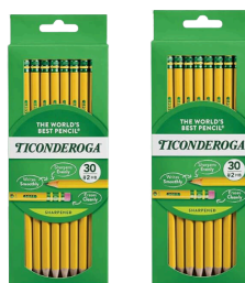
1 package of pencils (Ticonderoga preferred)