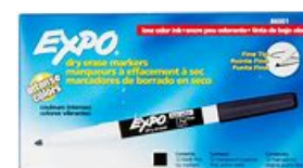
1 pack of black dry erase markers