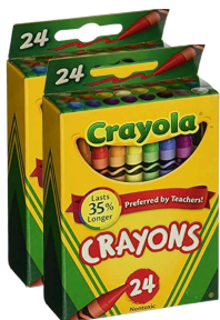
2 boxes of crayons