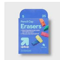
1 pack of cap erasers