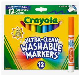
1 box of markers