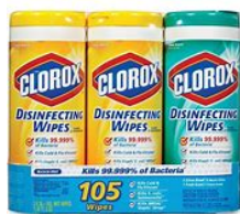
disinfectant wipes (any brand)