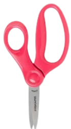
1 pair of scissors